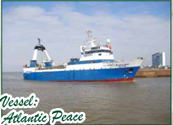
Vessel: Atlantic Peace

German Seafood Fish has been successful in the market for 60 years and during this period has shown continual and solid growth. German Seafood Fish is highly respected throughout the industry for the extremely high quality of its Frozen at Sea wild catch. Compliance with strict hygiene and freshness criteria at every level of the production process is of the utmost importance to. Their own fishing quota, modern trawlers, sustainable fisheries and wealth of experience in fishing and production guarantee the constant high quality of their products.